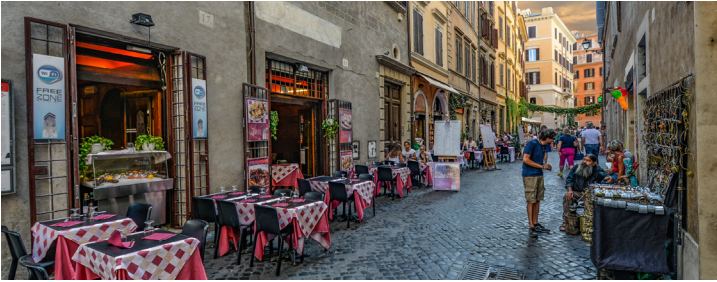
Tour: IT24 Code: A v.003 12/20/23

Full deposit required. Savings deducted from balance.